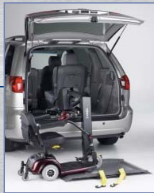
JOEY™ INTERIOR PLATFORM LIFT VSL-4000