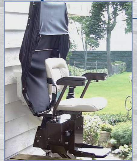
OUTDOOR ELECTRA-RIDE™ Model SRE-2000E The only 400 lb. capacity outdoor stairlift... an INDUSTRY EXCLUSIVE!