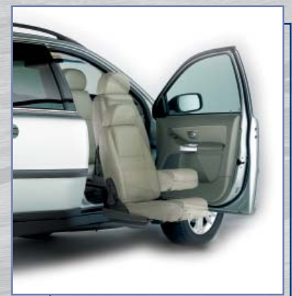
TURNY™ ORBIT SEAT

1780 Executive Drive, P.O. Box 84, Oconomowoc, WI 53066 (262) 567-4990 • FAX: (262) 953-5501 • www.brunoplatformlifts.com