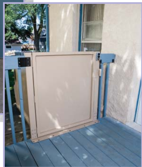
Optional - Top landing gate includes mechanical interlock released only with platform at the top landing.

“Bruno...First in Performance, Built to Last!”