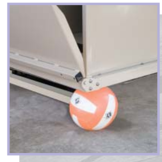
The entire bottom of platform is spring sensitive, shutting the unit down if an obstruction is encountered.

Safety is the watch word. Reliability is the standard. Value is the promise.