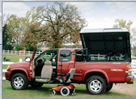
OUT-RIDER™ LIFT W/ POW'R TOPPER PACKAGE