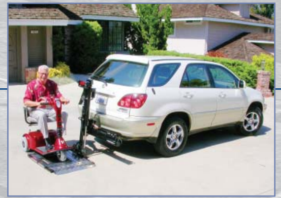
OUT-SIDER® MERIDIAN™ LIFT ASL-250