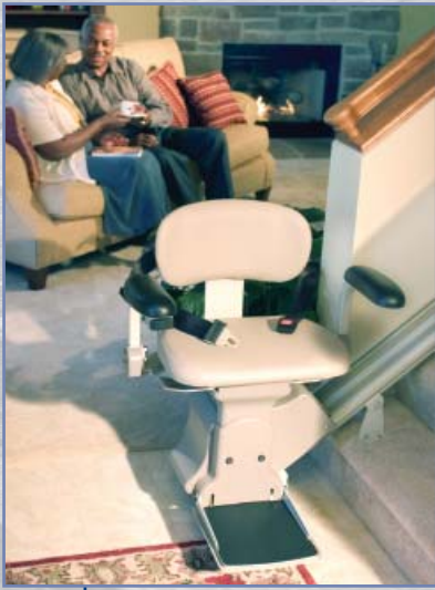
ELECTRA-RIDE II™ Model SRE-2750